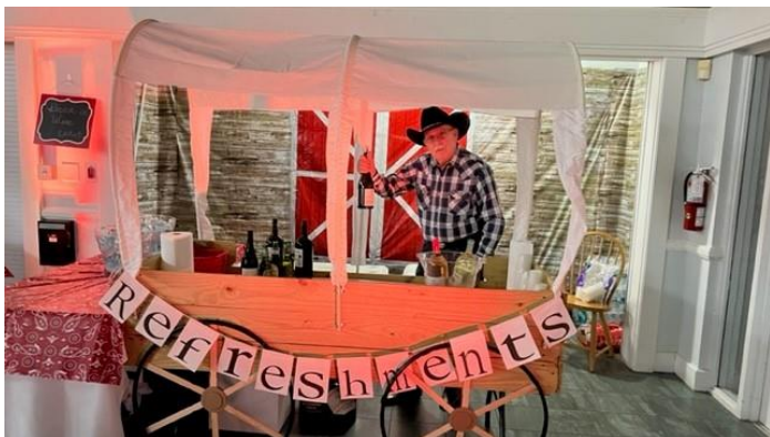
Thanks to our Knights who helped us manning the Bar.