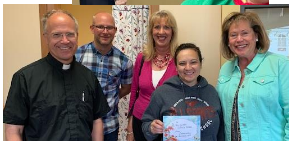
In May, we donated $2000 to All Saints Catholic School in support of Catholic education.