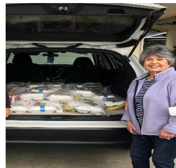
Every month, over 60 meals are prepared and delivered to feed the homeless in our area as well as our members in need.

In keeping with our theme of "Little Acts of Kindness", almost every month our members contributed to the Charity of the Month by bringing requested items to our meetings. We supported the "Backpack Program", which supplies children in need in our local public schools with healthy snacks for the weekends. We gave feminine products to our local St. Francis House and supported New Hope, a local haven for the homeless. We made contributions to our seminarian and to our newly ordained priest, both from All Saints Parish. Our membership includes ladies from St. Andrew, St. Cosmos and Damian, St. Martin of Tours, Holy Disciples, and All Saints parishes.