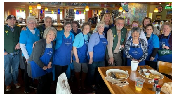
In support of the Knights Council 1629, we ran a Flapjack Fundraiser to help generate funding for their charities.