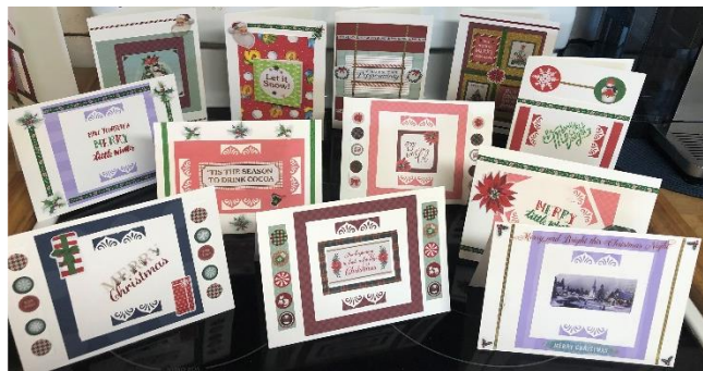
Over 300 handmade Christmas cards were created and delivered to area nursing homes and rehab facilities.