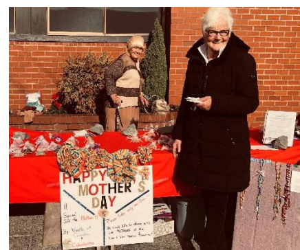
In May, our rosary ministry gave away rosaries and prayer shawls with the Knights after each Mass. They have continued to bless each of the five parishes we cover with rosaries, prayer shawls, and St. Benedict blessing beads.