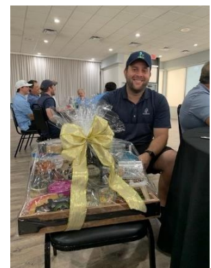
Raffle baskets donated by the Columbiettes and the winners of those baskets