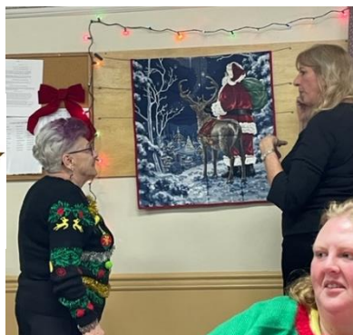
At our Christmas party, a quilt made by one of our members was a raffle prize.